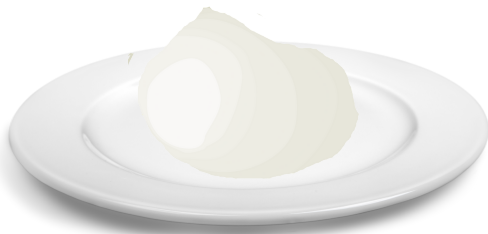
Plate 1: Dry cotton ball