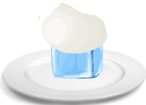
Plate 3: Dry cotton ball on an ice cube