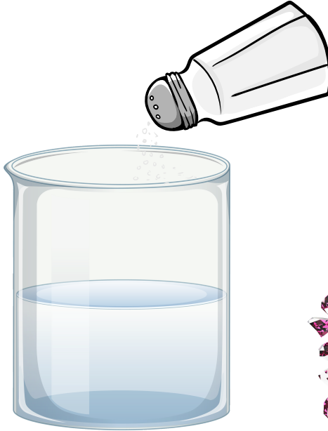
Beaker 2: Water and salt