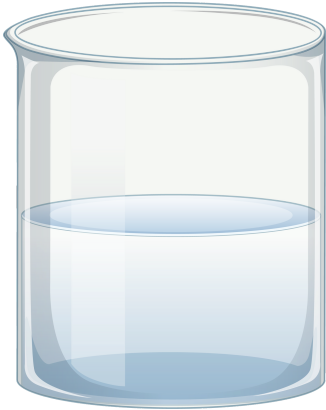
Beaker 1: Water